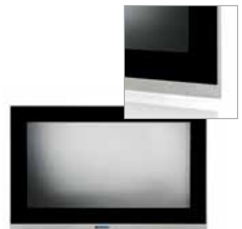
Aluminum P-CAP Multitouch