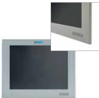
Aluminum with USB