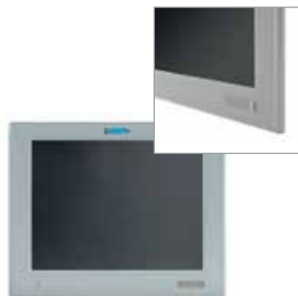
Aluminum True Flat with USB port