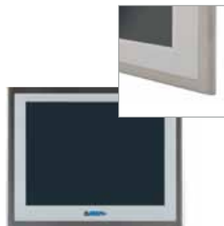
Stainless Steel True Flat